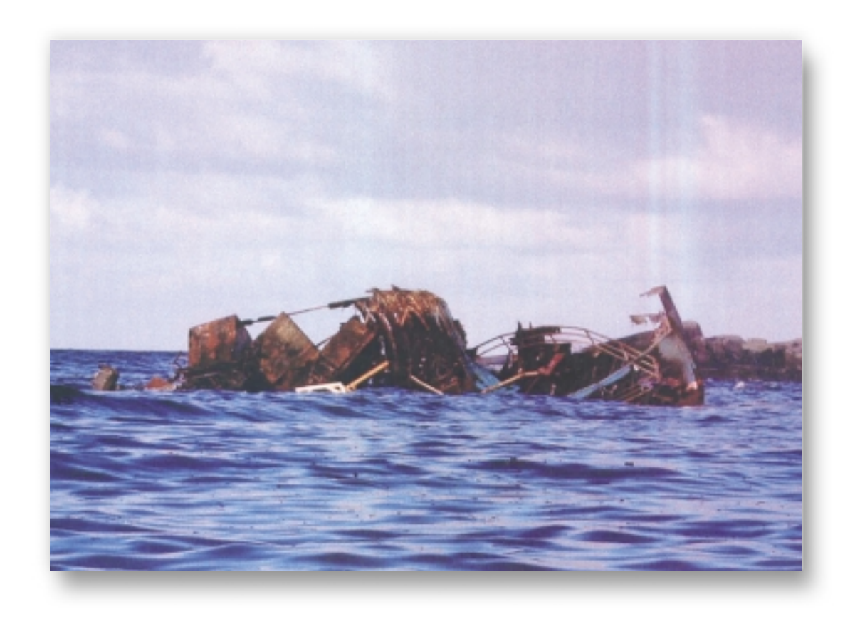
Photo of the Patriarch taken on the morning of the 2nd. September 2004 by LE Roisin.