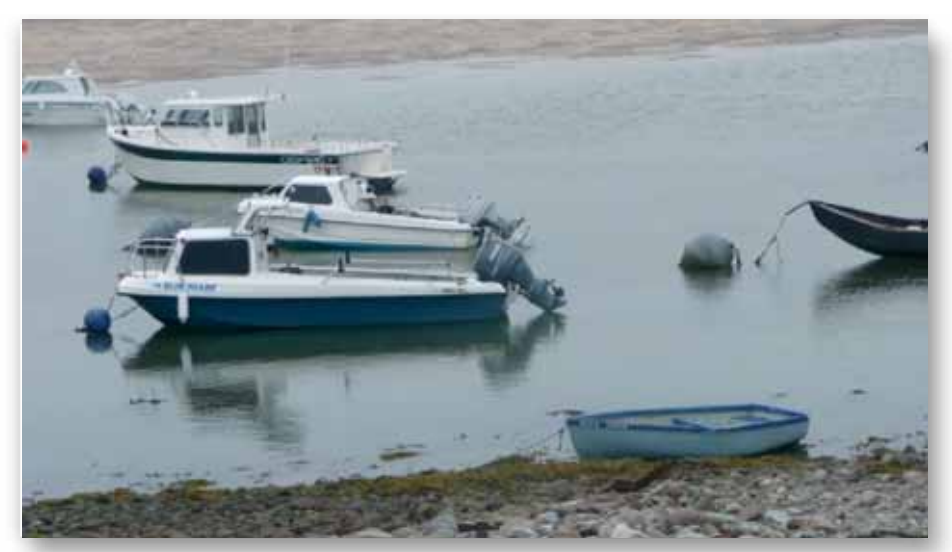
Photo 2 - Typical mooring arrangements of boats at Mulranny. (Further photos in Appendix 7.2)

Mr. Mulloy used a small inflatable dingy to go from the shore to his boat, the boat would be released from the mooring and the dingy would be left secured to the mooring buoy.