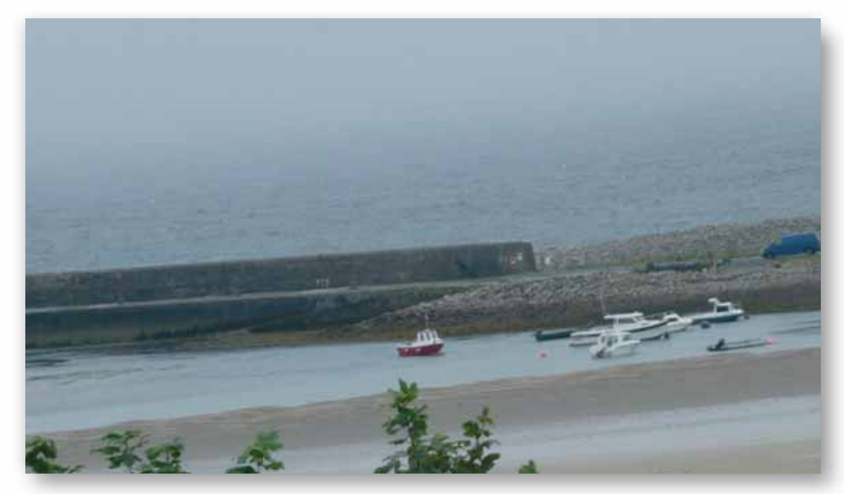
Boat mooring area and pier in Mulranny