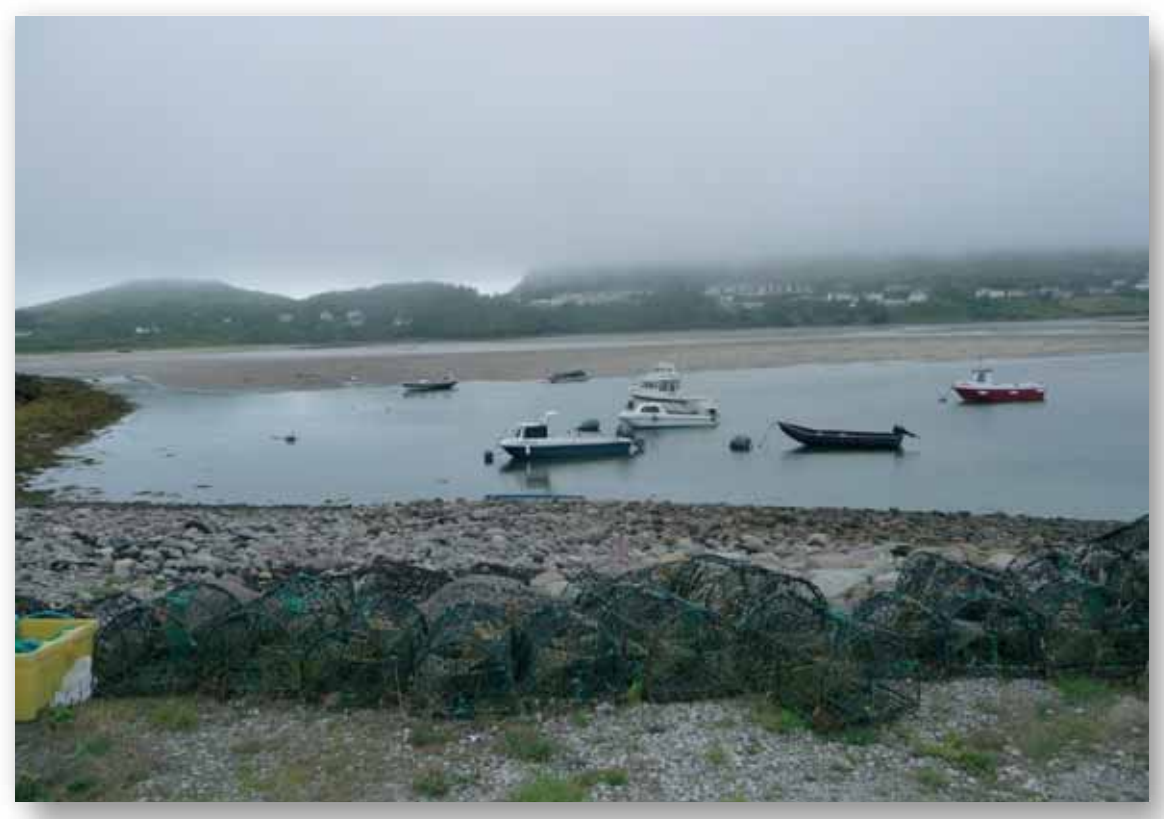
Foreshore area where the casualty was first brought ashore.