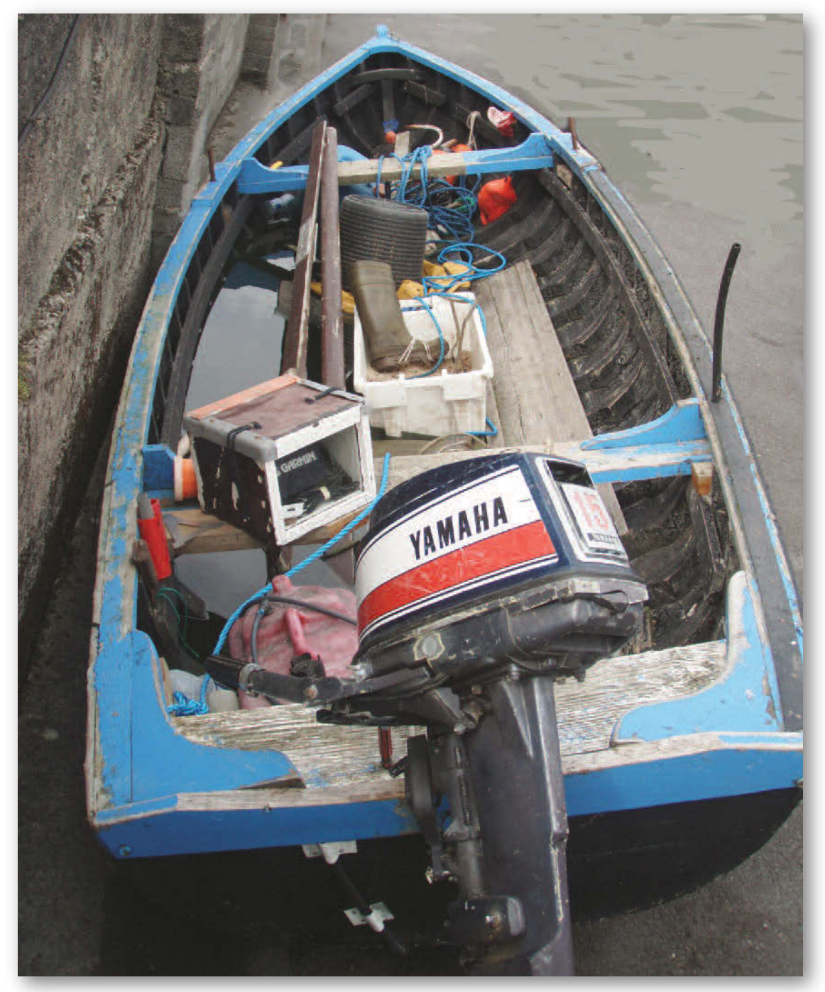
The Carraig Ainne