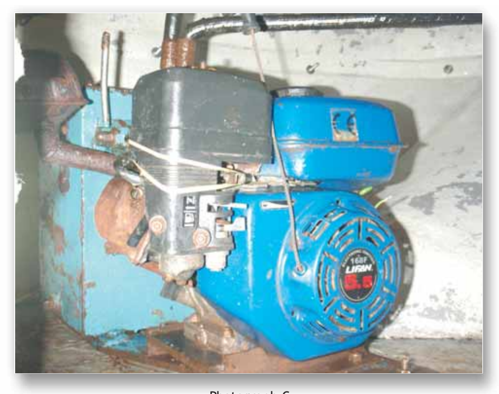
Photograph C Taken by MCIB inspector, of the donkey engine before the vessel was turned upright on the evening of 5th April 2011.