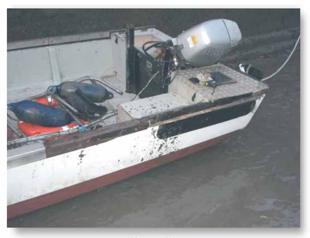
Photograph B of the after part of the vessel at Clogher Head after the vessel was turned upright on the evening of 5th April 2011.