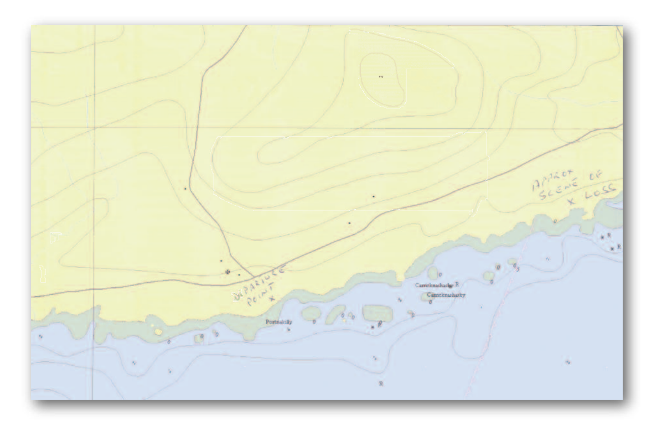
Appendix 7.2 Larger scale chart of location.