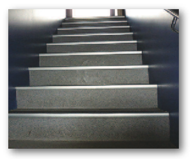
View of Stairwell from Bottom