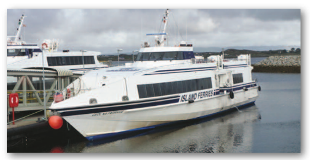
General View of the MV Ceol Na Farraige

General Description of Vessel: Twin screw, aluminium built ferry of carvel construction with a raked stem and transom stern.