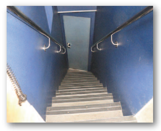
View of Stairwell from Top