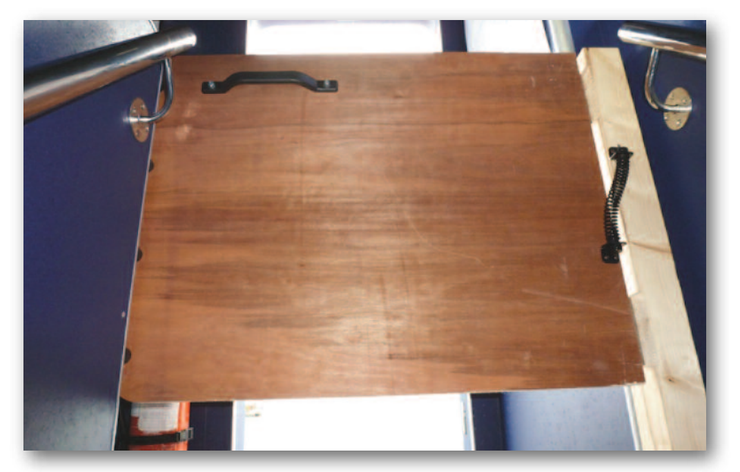
Spring Loaded Gate Subsequently Fitted at Top of Stairs, Preventing Accidental Stepping onto Stairs.