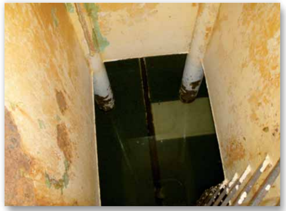
(f) VIVER Tank.