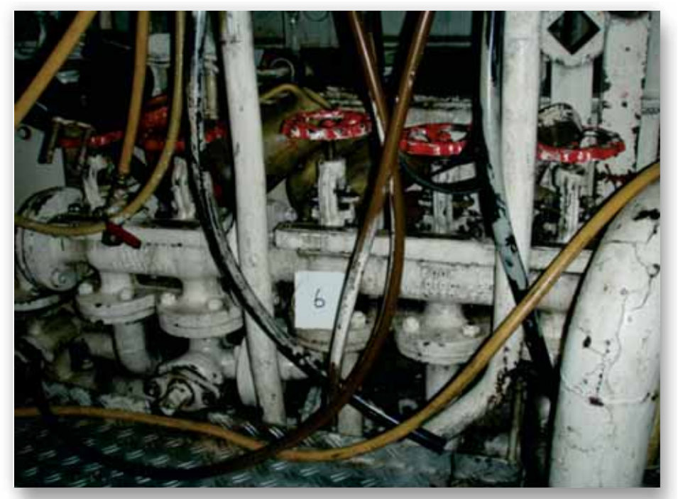
(d) Bilge valve manifold.