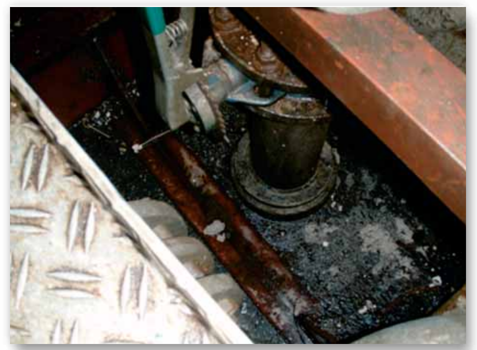
(c) The hydraulic oil cooling water inlet.

Appendix 9.4 Photographs of arrangements on MFV "Amy Jane".