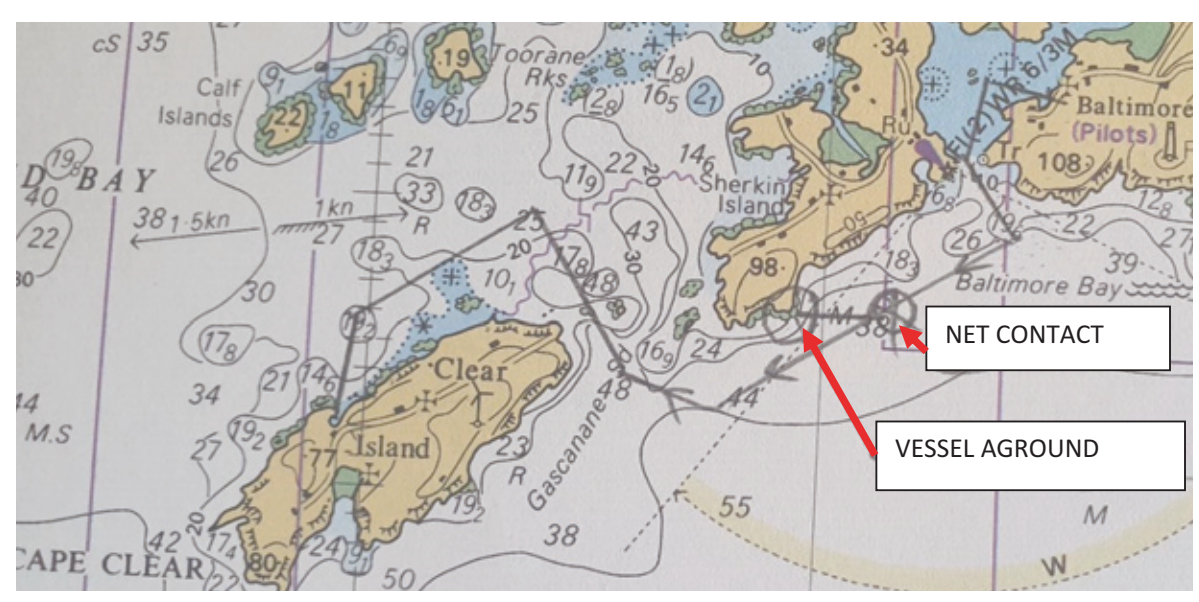
Course planned and estimated position of contact with the net and aground position shown