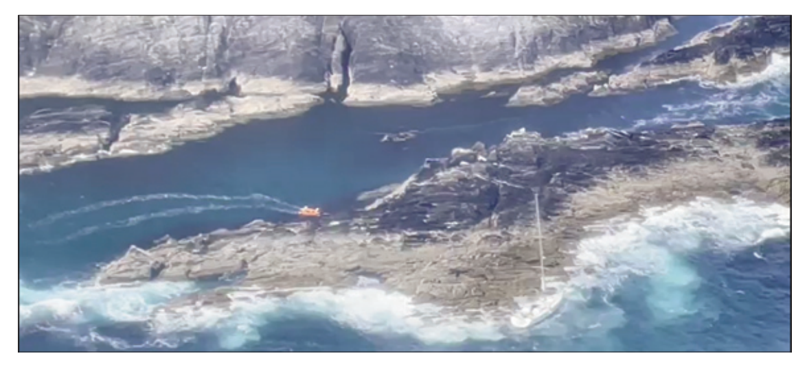
Screen shot from rescue helicopter R115 shows the yacht on the rocks and Y boat collecting crewmembers