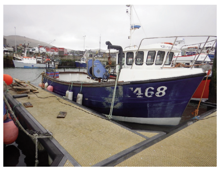
Boat in Dingle January 2023.

FV An Portán Óir was a glass reinforced plastic (GRP) hulled, decked fishing vessel with forward wheelhouse and an inboard diesel engine. There was a pot hauler fitted starboard forward side and open fishing deck aft.