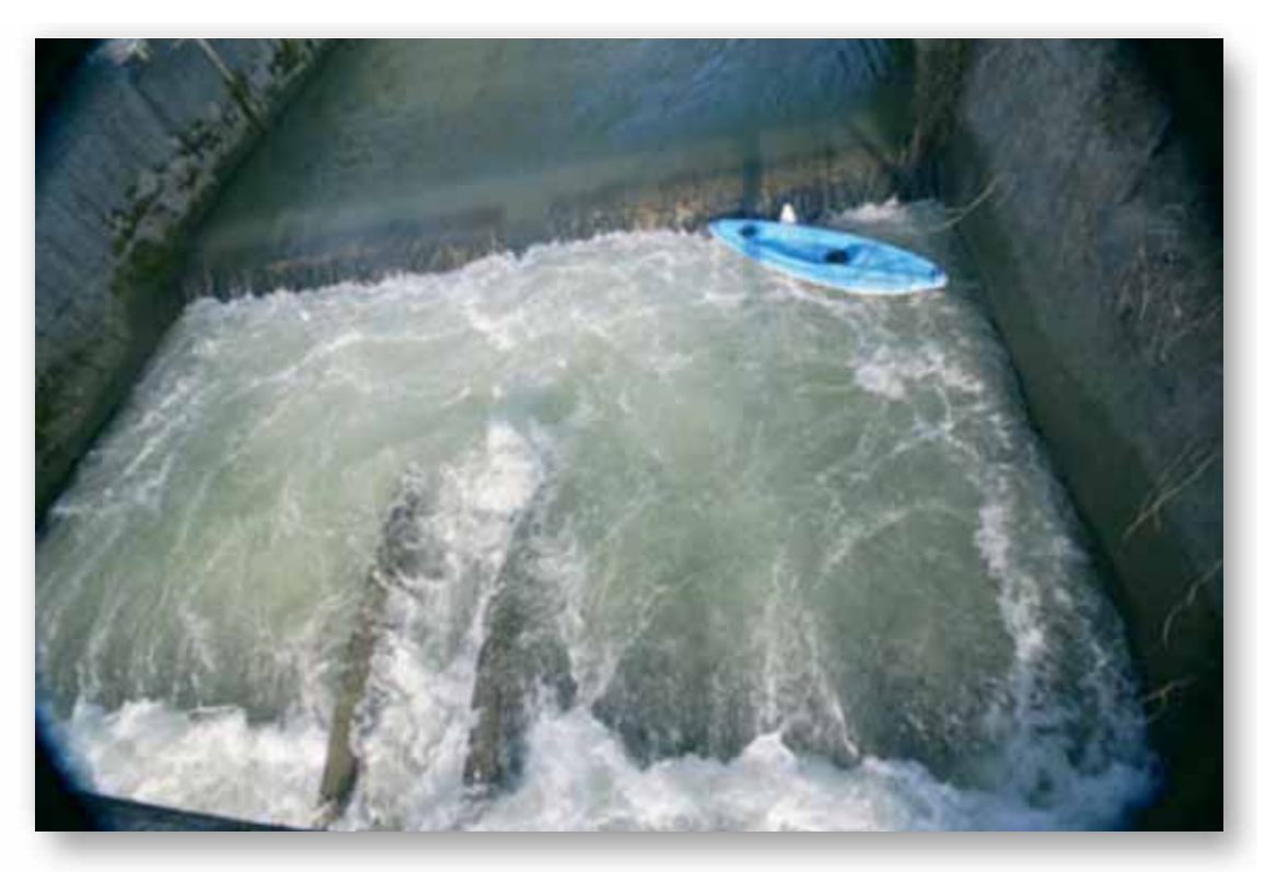
Note that the Bic Sports Kayak sit-on type Kayak is lodged firmly in the weir back flow after twelve hours.