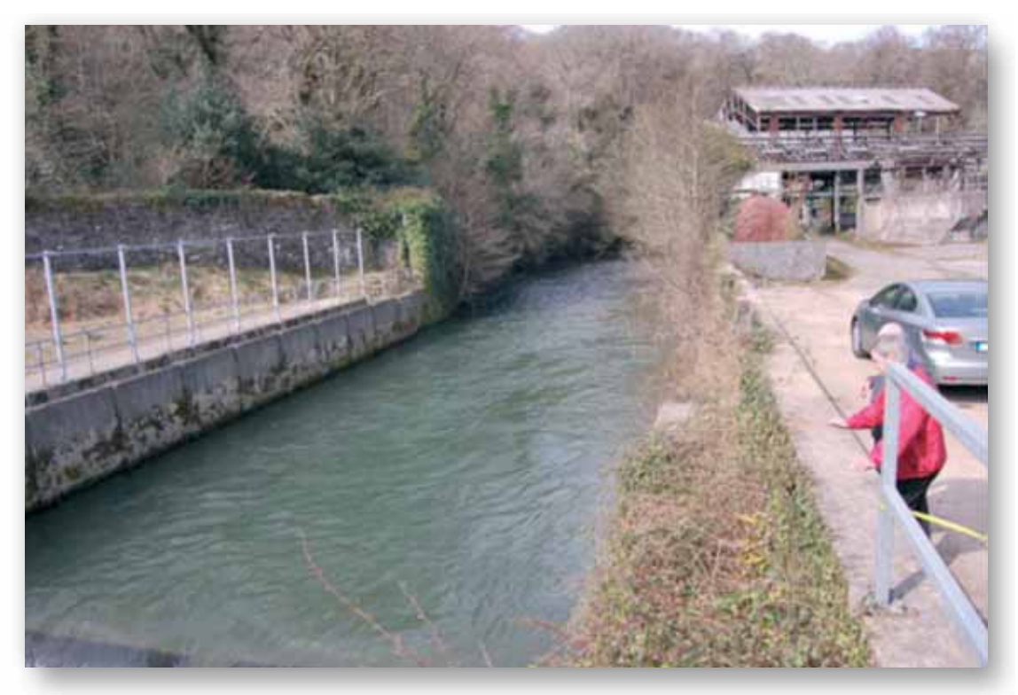
Above is the entrance to the weir. After the two men re-entered the water there was no easy way back.