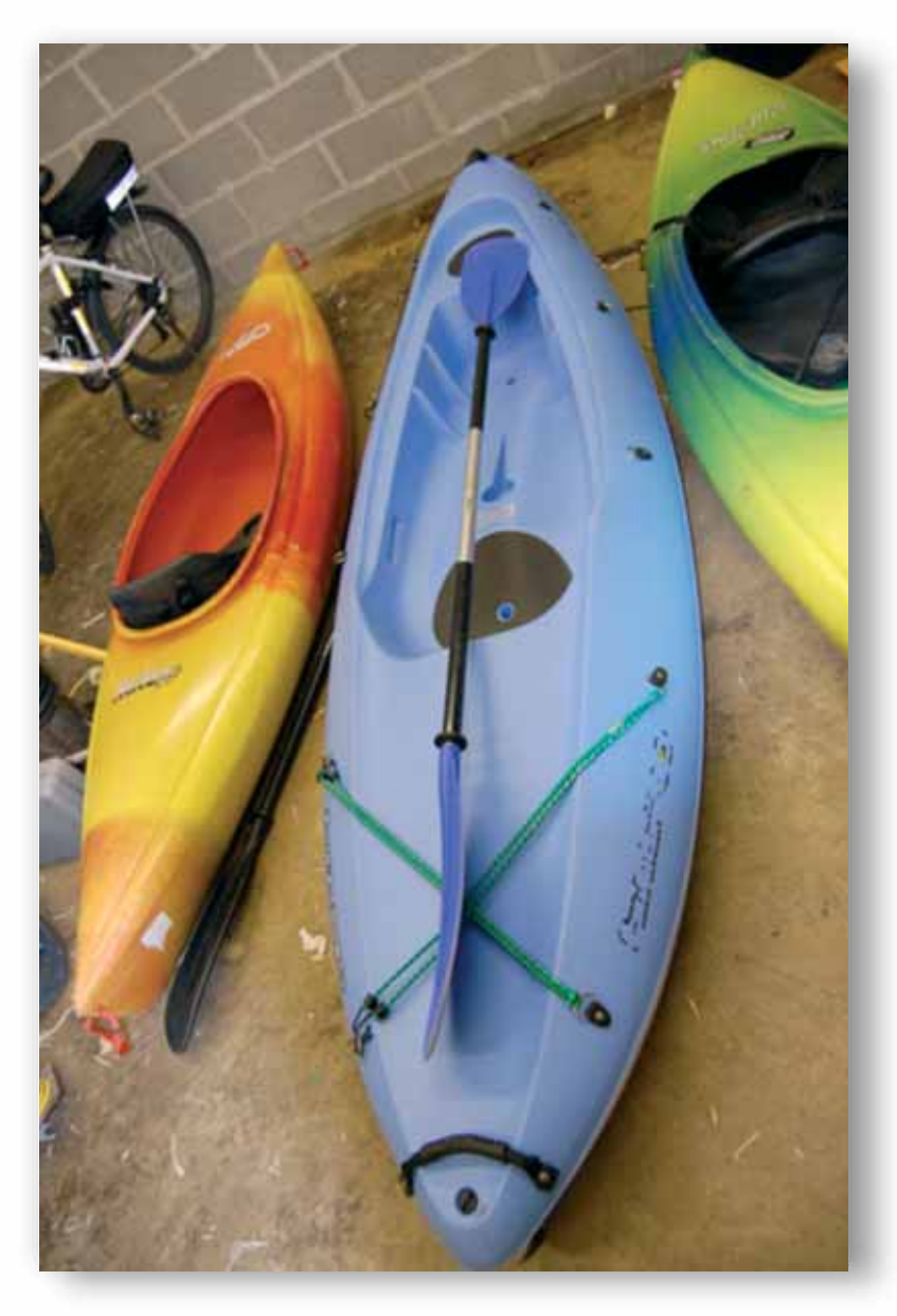
2 x Plastic Old town XT on left and right. Bic Sports Kayak blue in the centre. All are in near perfect condition.