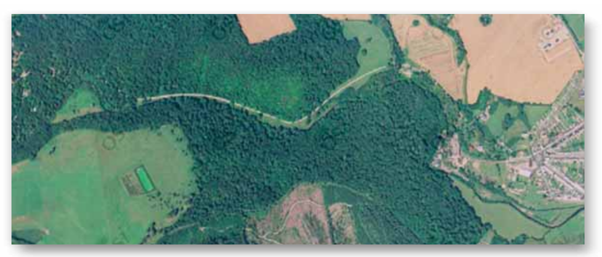
(a) Aerial Photograph of Clodagh River