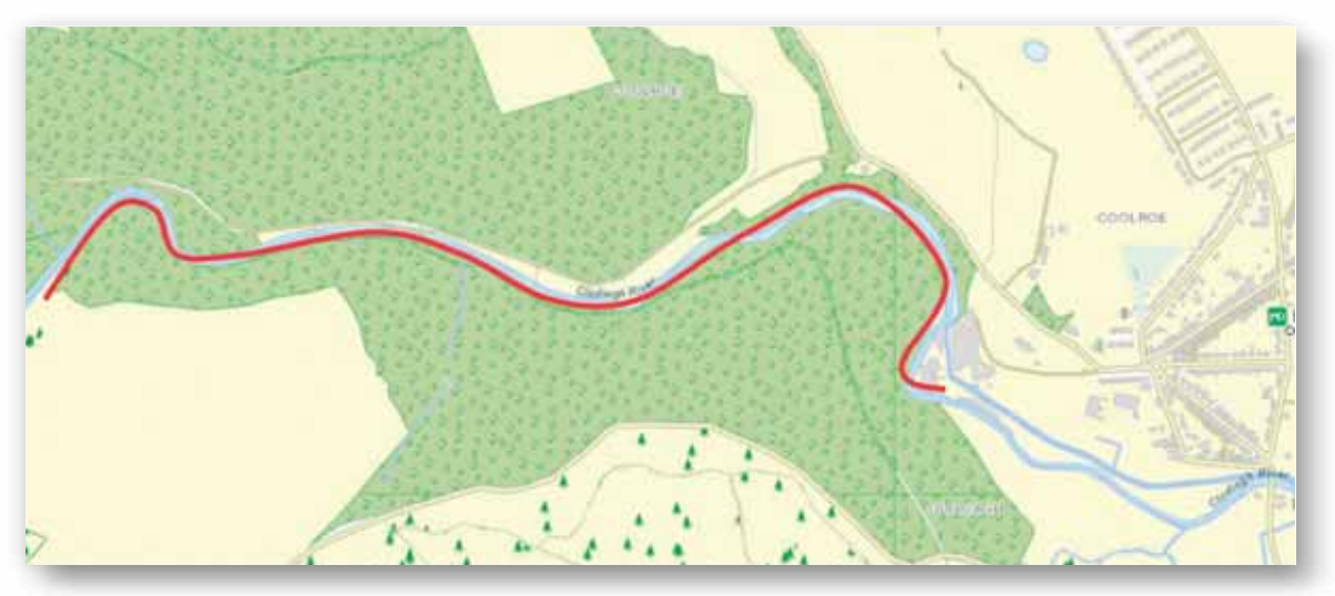
(b) Map of Clodagh river from Curraghmore Estate to Portlaw