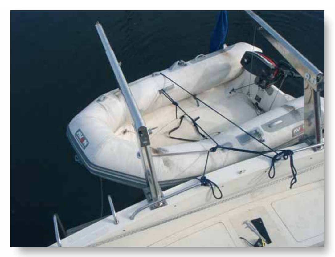
Tender seen at Berth 25 Galway Marina, on 15 October 2010.

Note: The tender was tied to the stern diving platform of the 'Quo Vadis'. The tie line had not been disturbed since the accident pending the attendance of MCIB to inspect vessel and tender. One timber oar was found strapped-in on the port side of the tender and the other oar was found on the beach. The seat was also found on the beach. Both items were retained by An Garda Síochána for the Investigation.